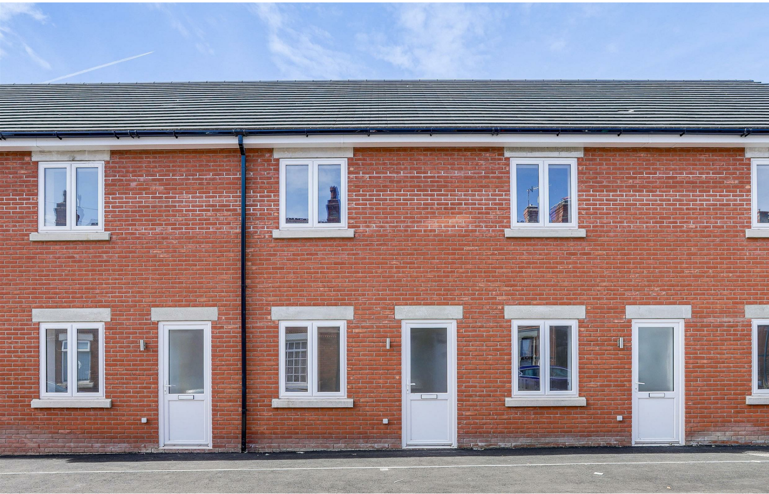
Merchant Street, Bulwell, Nottinghamshire NG6 8GU